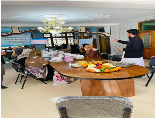
Figure 1 Parwan Female MIYCN Training