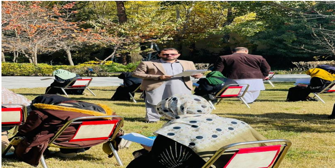
Figure 1 Taking Exam of Nutrition Nurse, Consular and screener