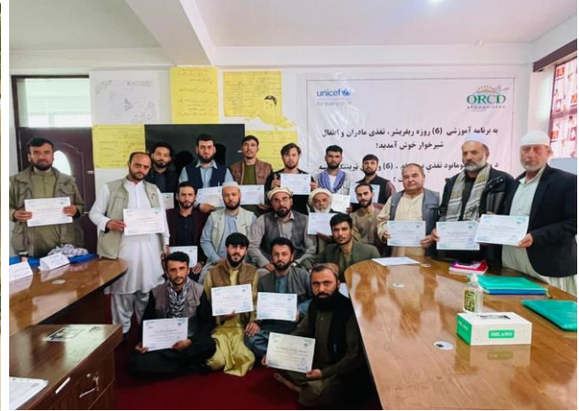
Figure 2 Male MIYCN Training

Health workers demonstrated improved knowledge and skills in promoting good nutrition practices for mothers, infants, and young children by acquiring good knowledge and skills. The project increased the capacity of health care providers to provide high-quality nutrition services to their clients.