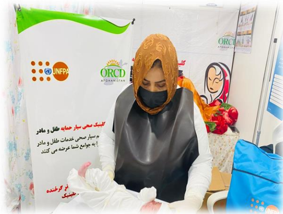
Figure 1 Midwife, After Childbirth Services