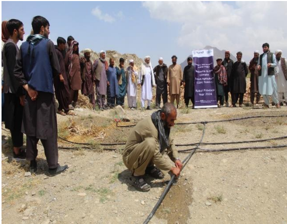
Figure 6 CSA training to the farmers in Charasiab district of Kabul

Totally 7 greenhouse, 12 goat rearing enterprise, 2 turkey form enterprise and 4 laying hen form established in 12 targeted village of Dehsabz and Charasiab district and 178 individuals and 1246 HHs benefited from this project.