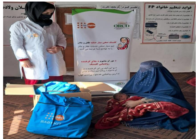
Figure 3 The M&B kit has been distributed by Doshi MHT MW, at qaradaka village of doshi