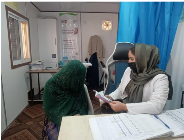
Figure 4 The Midwife of Doshi MHT- provided ANC services to a pregnant woman at Doshi district of Qaradaka village, Baghlan province.