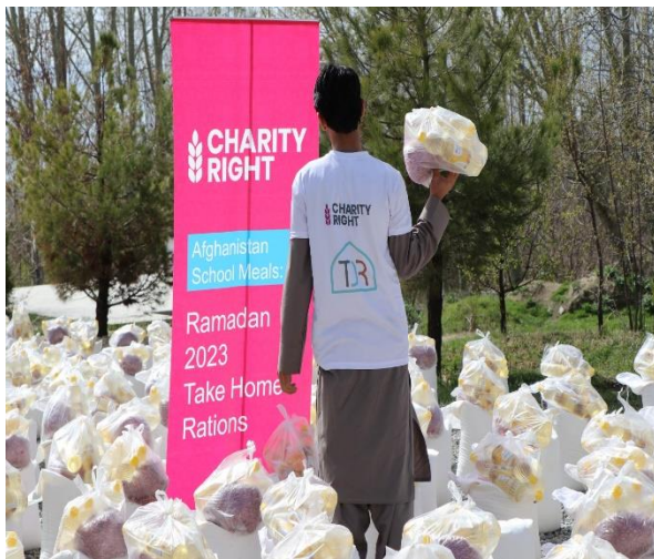
Figure 1 Ramadan Food Packs to Student families

Meals were consistently provided according to the agreed menu and portion specifications. The primary outcomes of the program included improved school attendance, increased student registration, enhanced nutritional status of beneficiaries, and improved academic performance.