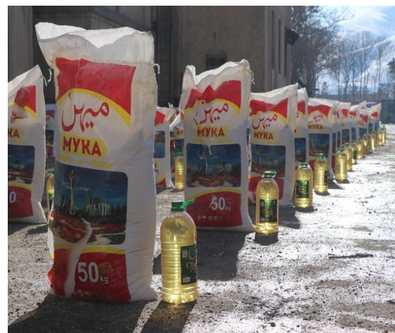
Figure 2 Distribution of Food items