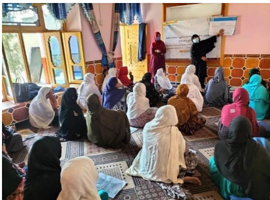
Figure 1 Cascade training, Narang, Aug 29,