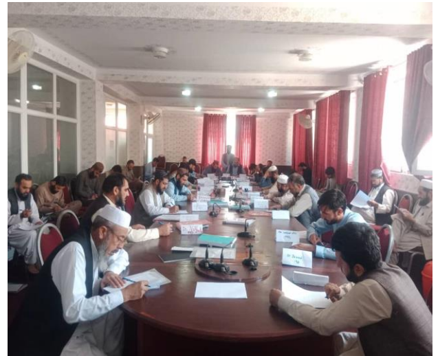
Figure 2 Kabul Male MIYCN Training