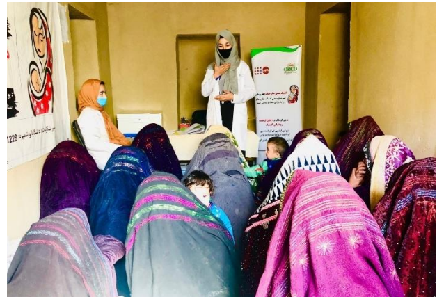
Figure 2 During Health Education