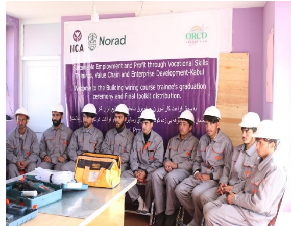
Figure 5 Graduated trainees from Building electricity wiring in Charasiab district of Kabul