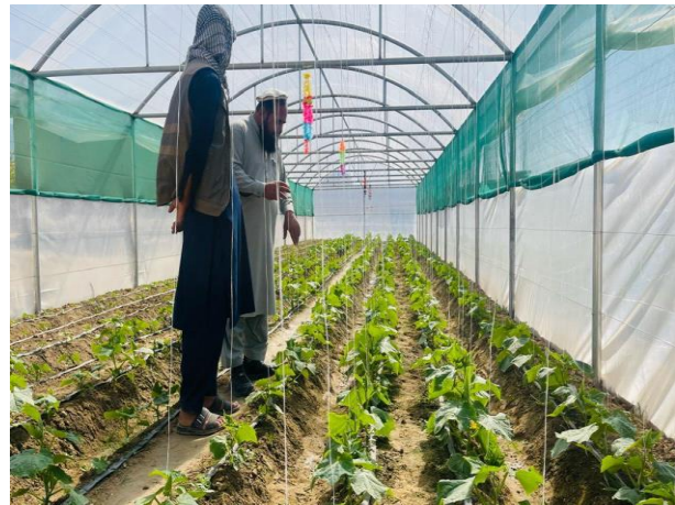
Figure 7 Established greenhouse in Seh Qala village of Dehsabz