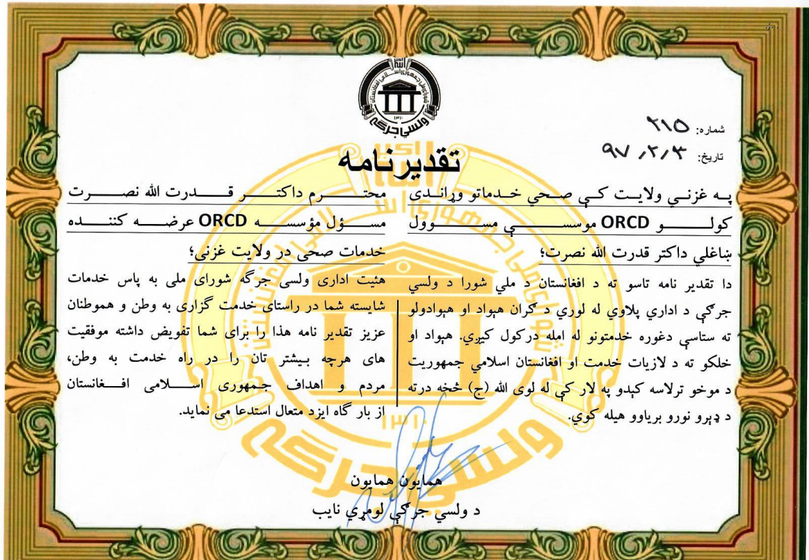
Lower House of the Parliament Appreciating ORCD's activities in Afghanistan