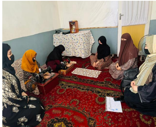
Figure 2 Meeting with women led enterprises