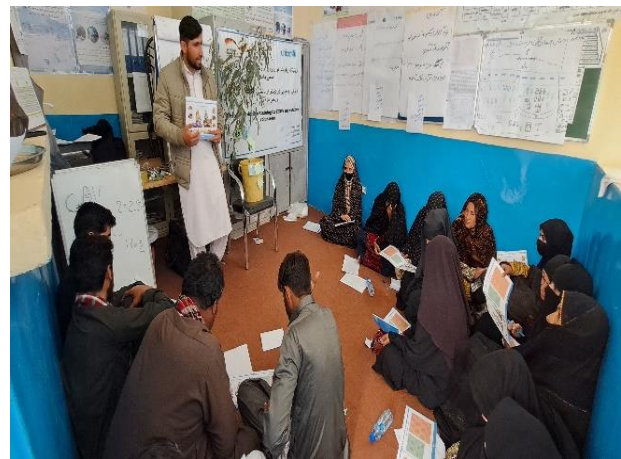
Figure 2 Community Mobilization Session