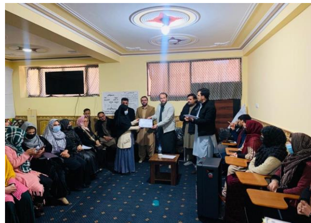
Figure 2 Female MIYCN Training