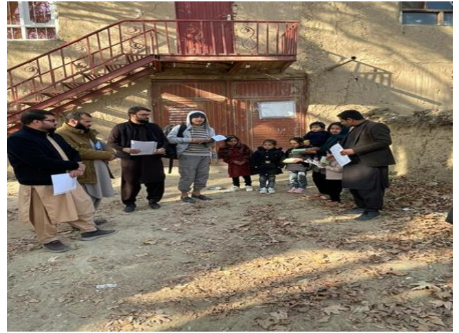
Figure 2 Parwan MNP NFI Monitoring