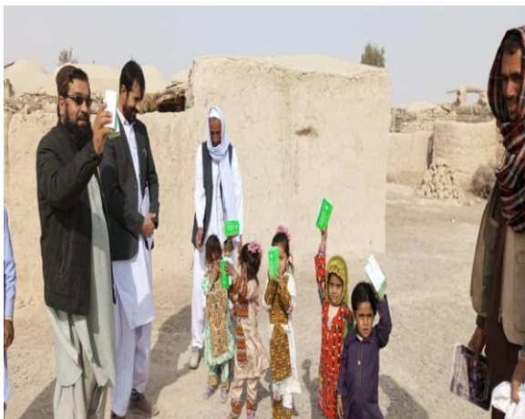
Figure 1 MNP Campaign

In 2024, two MNP (Micronutrient Powder) distribution campaigns were conducted for children aged 6-59 months in all areas covered by health posts, as well as in white areas. Additionally, in 2024, ORCD conducted three C-WIFs campaigns in Nimroz province, distributing community-based weekly iron and folic acid supplementation to adolescent girls aged 10-19 years in both health post coverage areas and white areas.