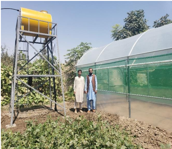
Figure 1 Greenhouse establishment

The project also emphasized economic empowerment through the establishment of 30 small enterprises, including greenhouses, poultry farms, and food processing units. Cash grants were distributed to 100 women to revive non-functional businesses, while 130 women and girls received training on managing small enterprises. Community awareness campaigns engaged 66,740 individuals via youth educators, social mobilizers, Islamic teachers, and local media channels. These campaigns addressed topics such as social norms, health habits, and GBV prevention. Additionally, 3,555 adolescents participated in sessions led by youth educators.