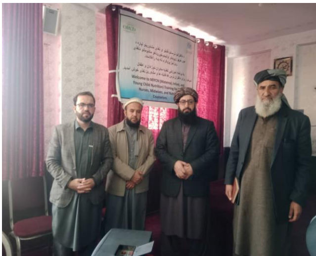
Figure 1 Meeting with PND Directorate Kabul

Trained Healthcare Providers: A total of [277] healthcare providers, including nutrition counselors, doctors, nurses, and midwives, received comprehensive MIYCN training.