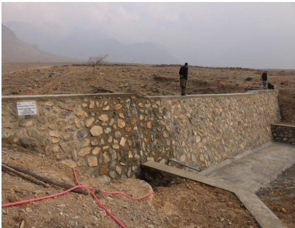
Figure 8 Constructed check dam in Dawood Shah khil village of Dehsabz