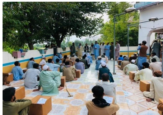
Figure 2 Hygiene kits distribution, Sept 21 ,2023