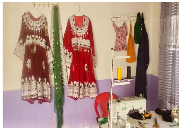
Figure 4: Products of the small homebased enterprises