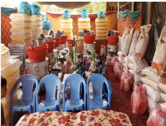
Figure 3 supplies for the home base enterprise