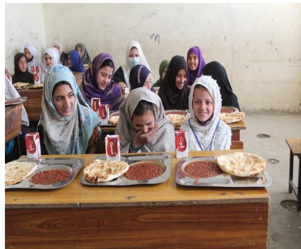
Figure 2 Students taking balanced food at the school