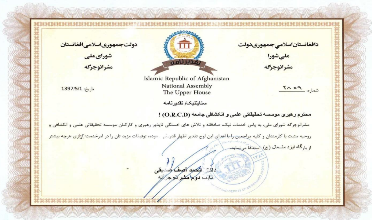
Upper House of the Parliament Appreciating ORCD's activities in Afghanistan