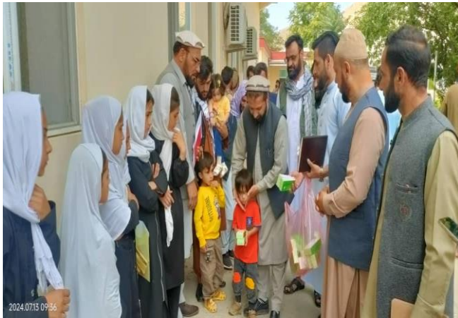
Figure 1 Panjshir MNP NFI Campaign