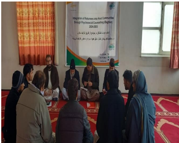
Figure 1 Focus group Discussion