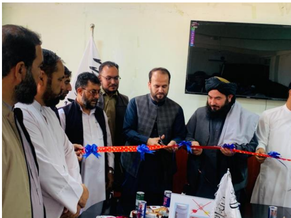
Figure 1 Kapisa MNP NFI Campaign Ceremony

The Community-Based Nutrition Program (CBNP), funded by UNICEF and implemented by ORCD in Kapisa, started in 2023-18-sep to 2024-18-sep and continued into 2024. This project is being implemented in all districts of Kabul. According to the project's contract and framework, ORCD implemented the CBNP program in 400 health posts, so we will have CBNP Follow up in all HPs in all districts of Kapisa, last year we had MIYCN training for health staff from Difference Parts and Health Facilities of Kapisa.